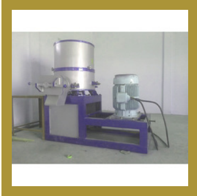
Plastic Agglomerator Machine