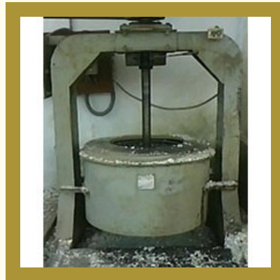
Plastic Reprocess Machine