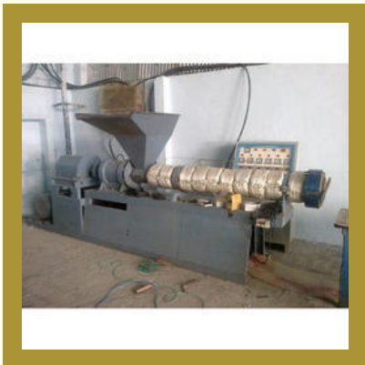
Used Plastic Process Machinery