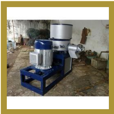
Plastic Dusting Machine