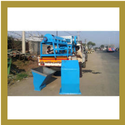
Plastic Dewatering Machine