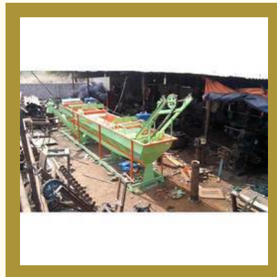
Plastic Washing Plant