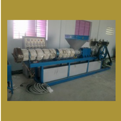
Plastic Recycling Plant