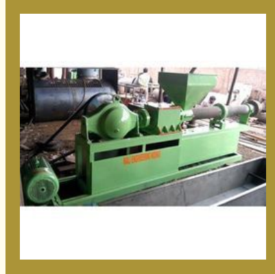
Plastic Granules Machine