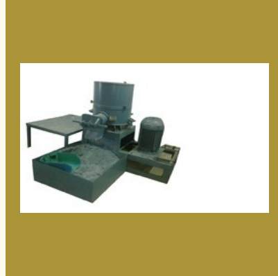
Plastic Bottom Fitting Machine