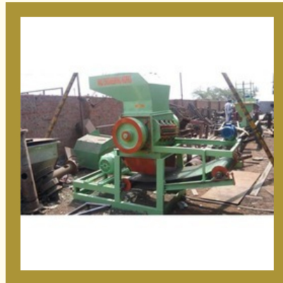
Plastic Wet Grinder