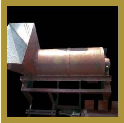
Waste Plastic Dryer